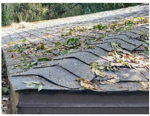
923-1 Asphalt Shingle/Tar Typical Exterior Roof