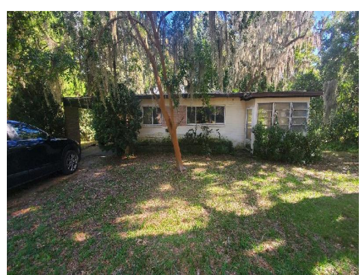
923 NE 10<sup>th</sup> Avenue Ocala, FL 34470