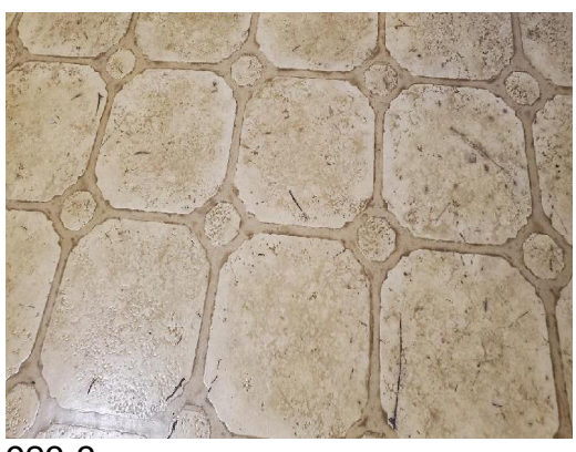
923-3 Rolled Flooring (20% Chrysotile) Mastic Interior Kitchen (approx. 150 sq. ft.)