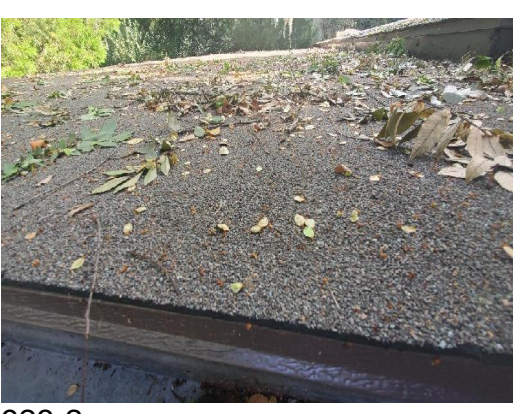
923-2 Rolled Roofing Carport/Enclosed Porch