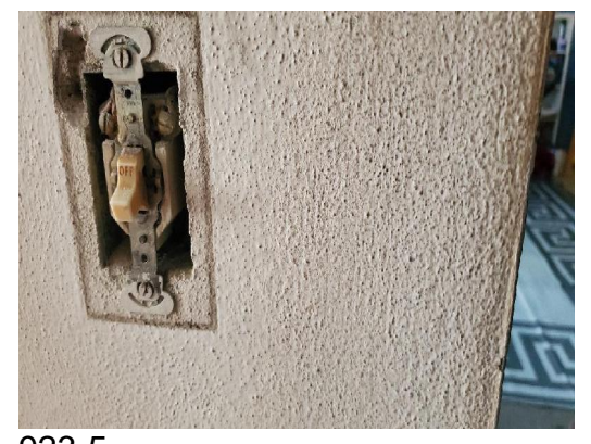
923-5 Plaster Typical Interior Walls/Ceilings