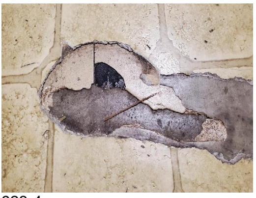
923-4 9"x9" Floor Tile (2% Chrysotile) Mastic Interior Kitchen (approx. 150 sq. ft.)