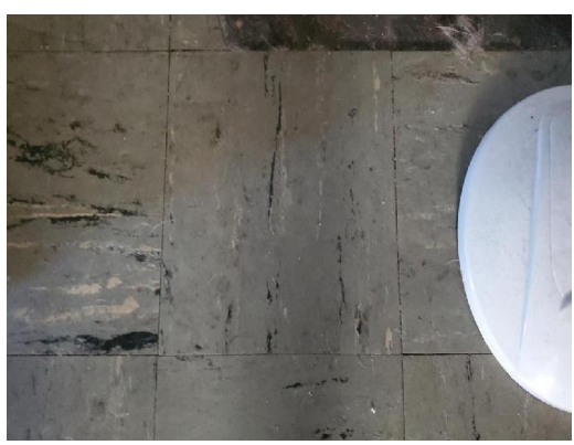
923-6 9"x9" Floor Tile (5% Chrysotile) Mastic (4% Chrysotile) Typical Interior Floors (approx. 575 sq. ft.)